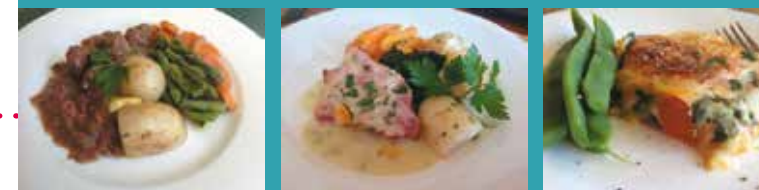
Images of actual meals, thawed, heated and plated

For the best and tastiest results thaw meals first.. before heating.